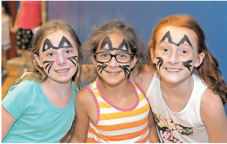
Having a Cat-tastic time at the Summer Playground Family Night Carnival

Around. The new outdoor playground and SplashPark are open for your enjoyment, weather permitting.